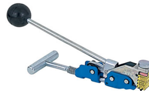
T300 Centre Punch Tool

Starting a project and need BAND-IT® products? We ship nationwide and are able to send express!