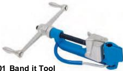
C001 Band it Tool

Click on the image to save or open the instruction manuals: