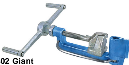
G402 Giant BAND-IT® Tool