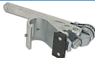
J050 Heavy Duty Adapter Recommended for band widths greater than 13mm