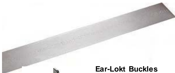
Ear-Lokt Buckles In various widths For BAND-IT® 201 Stainless Steel Bands.