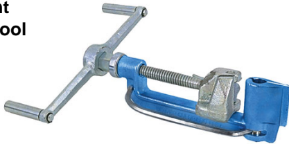
G402 Giant BAND-IT® Tool