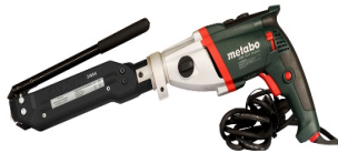
UL9010 Ultra-Lok Tool DELETED