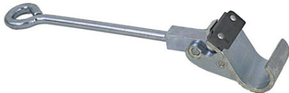
J001 Adapter Recommended for band widths less than 10mm