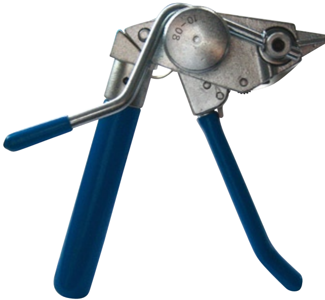
■ C075 Bantam Tool

– Can you afford to ignore the advantages?