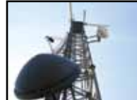
Telecommunications & Utility