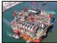
Offshore Oil Rigs