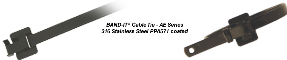
BAND-IT® Cable Tie - AE Series 316 Stainless Steel PPA571 coated

The AA's Nylon 11 coating has very good chemical and weathering resistance, long-life expectancy, and is halogen free and non toxic when exposed to flame.