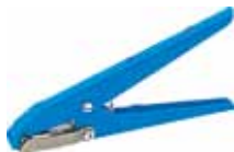
Cable Tie Tensioner