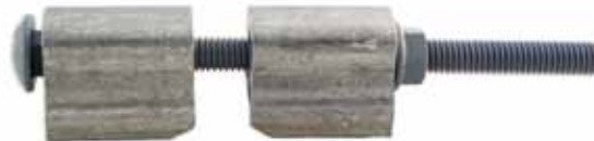
BAND-IT® Bolt Clamp - 1-1/4"